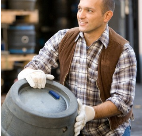
HID Global can create a custom tag solution to fit your application requirements for chip type, dimensions, programming and materials.